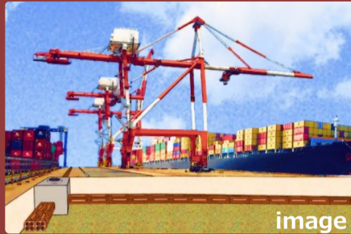
Ceramic duct for container yard